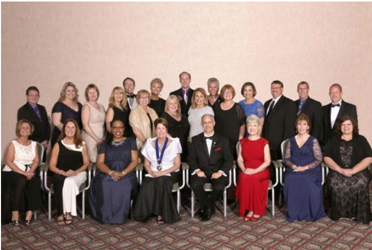
2017-2018 IIMC Board of Directors