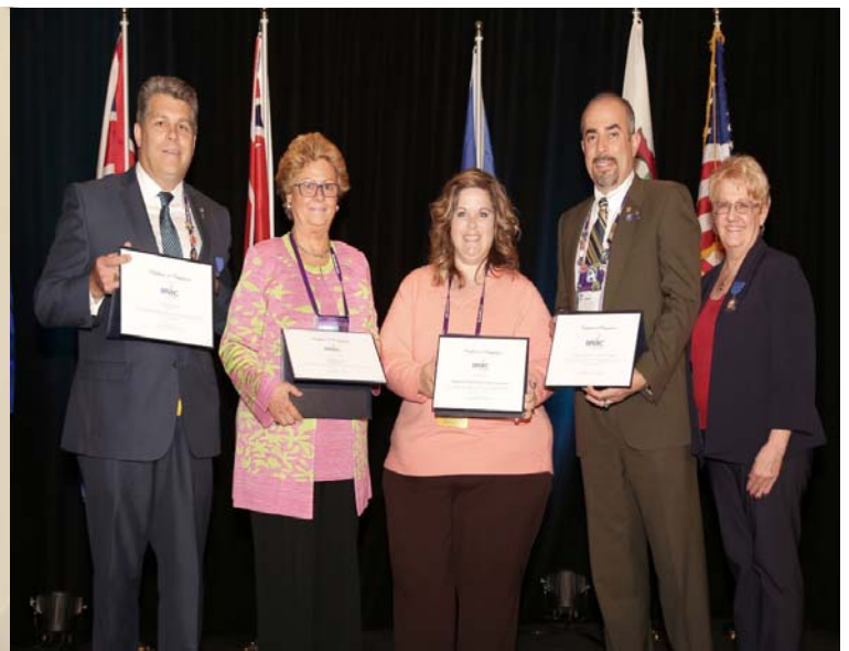
Photo: Certificate of Recognition, IIMC Step Up Award.